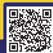
Scan QR code for more information